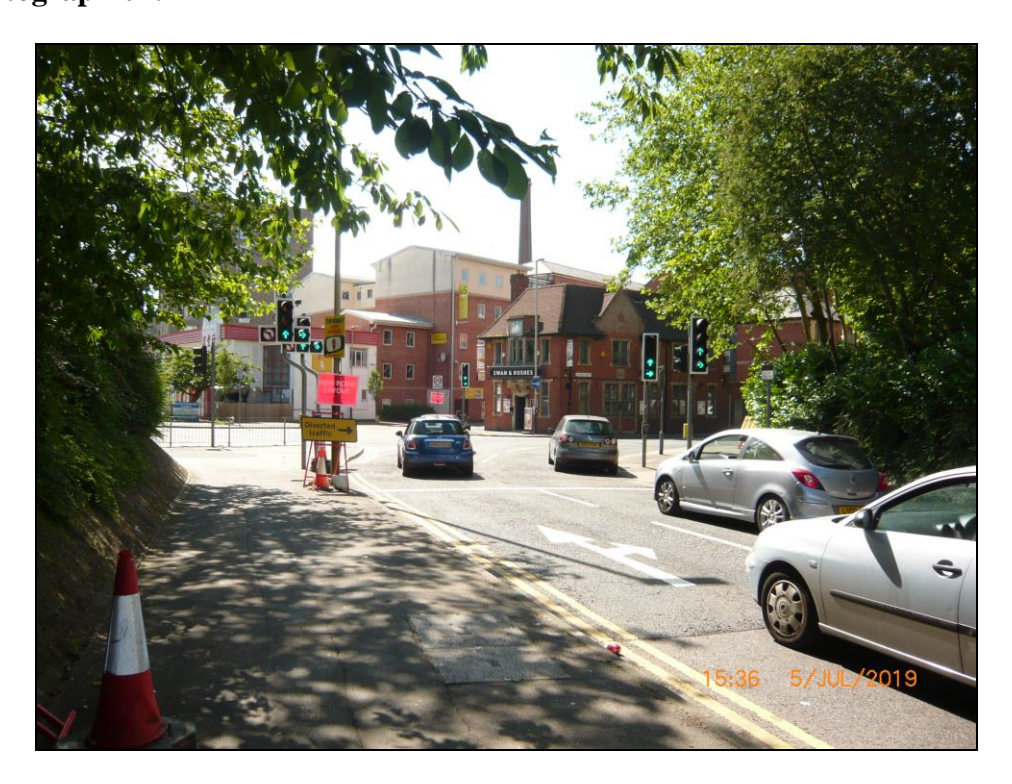
New route from Carlton Street across Oxford Street into Grange Lane.