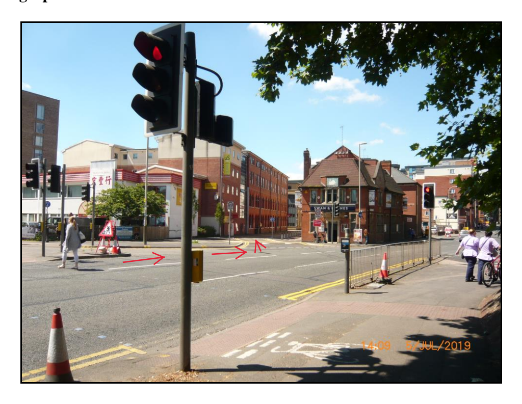
New junction from Oxford Street into Grange Lane.