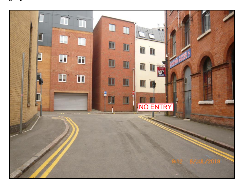
DO NOT TURN RIGHT INTO GRANGE LANE FROM DEACON STREET.