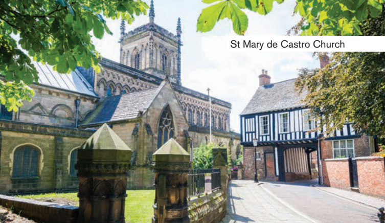
St Mary de Castro Church