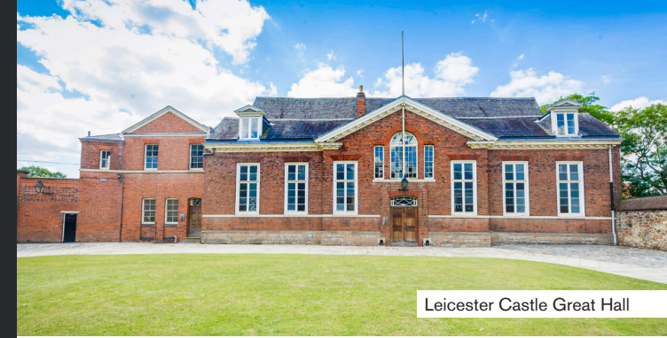
Leicester Castle Great Hall