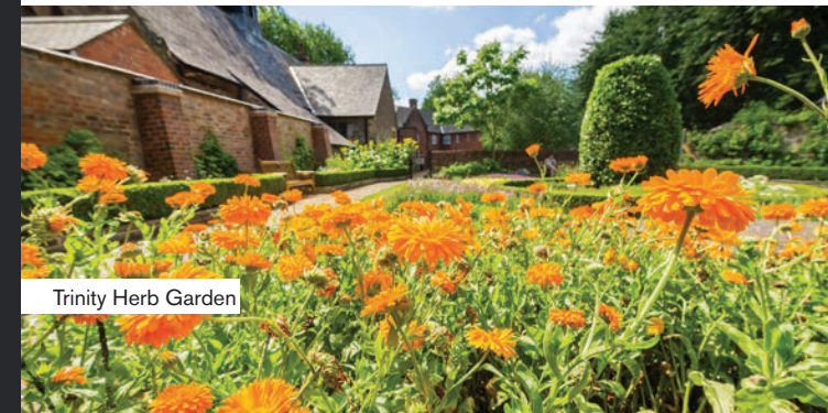
Trinity Herb Garden