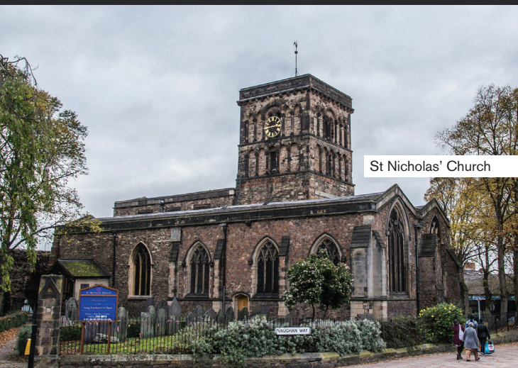
St Nicholas' Church

Built in 1423, the Turret Gateway separated the Newarke religious precinct from Leicester Castle. Locally it is also known as Rupert's Gateway, as Prince Rupert and King Charles I commanded the royalist army that captured Leicester Castle in 1645 during the English Civil War.