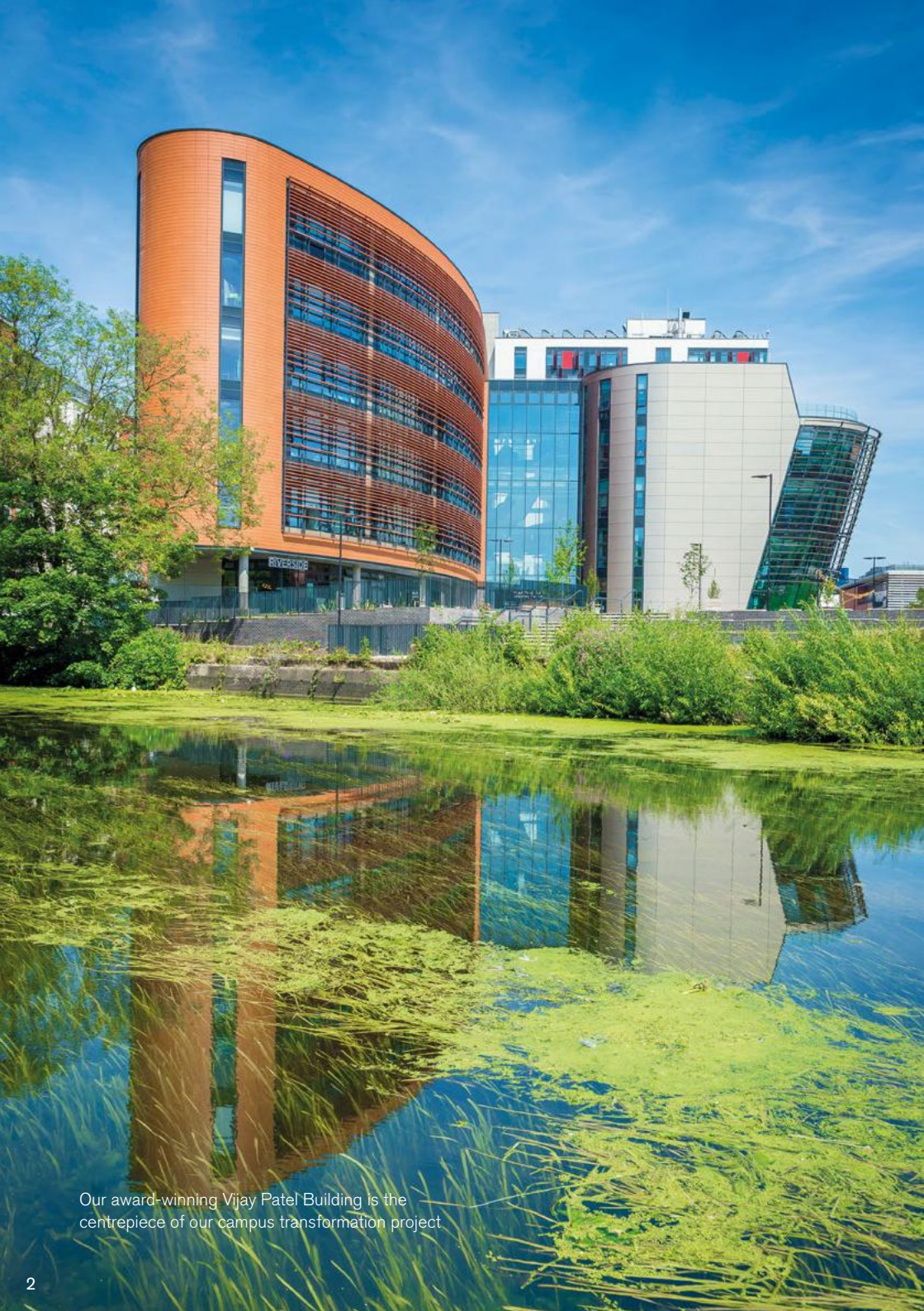
Our award-winning Vijay Patel Building is the centrepiece of our campus transformation project